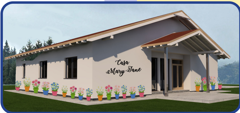
Casa Mary Jane